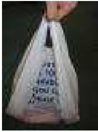
Thickness 10 microns