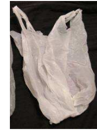
Thickness 25 microns

Hydro-biodegradable bags are 2½ times thicker than Oxo-biodegradable bags for the same strength